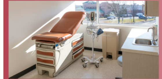
One of Southwest Community Health Center's examination rooms in our new facility