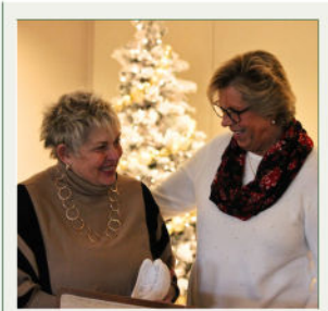
Norwalk Celebrity Breakfast

Make a donation today: www.ccfairfield.org/donate Or scan the QR code with your smartphone