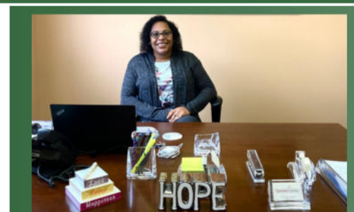
New Outlook Counseling

Serving everybody in need is at the heart of our mission. We strive to make our services accessible, affordable, and culturally competent at New Outlook Counseling. Financial constraints should never hinder finding peace and harmony in your family life. Our commitment to fostering a community of support remains unwavering, ensuring that everyone feels empowered on their path to well-being.