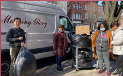
Morning Glory Breakfast Program team in Danbury during a coat drive