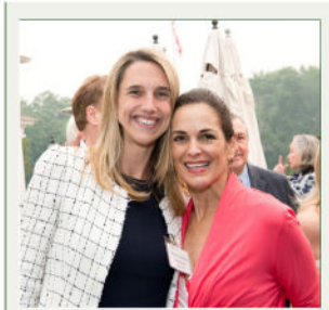
New Covenant Center Summer Soirée