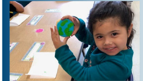
Room to Grow Preschool