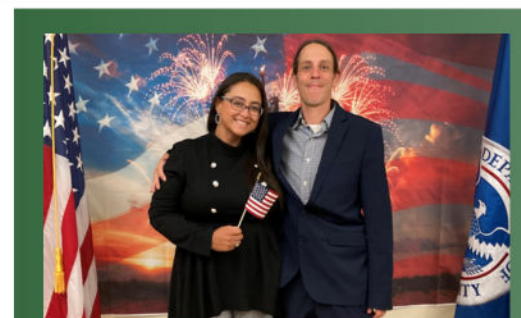
Immigration client celebrating new citizenship

By fostering a community where empathy intertwines with immigration services, we aspire not only to assist individuals on their citizenship journeys but also to create a compassionate environment that echoes the shared humanity in each person's story.