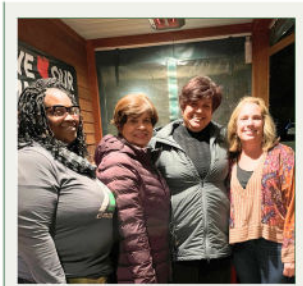
Morning Glory's Rib Rally