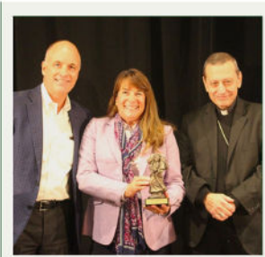
Danbury Celebrity Breakfast