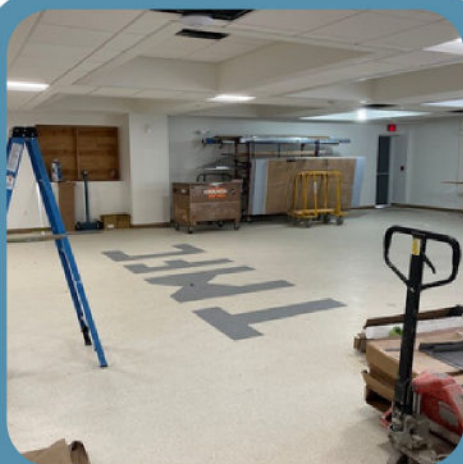
Exciting progress being made during construction at the new location!

The Thomas Merton Family Center's renovation has made significant progress since its groundbreaking event in April. We hope to finish construction and open the doors of this exciting new facility at 1406 State Street in Bridgeport in late November.